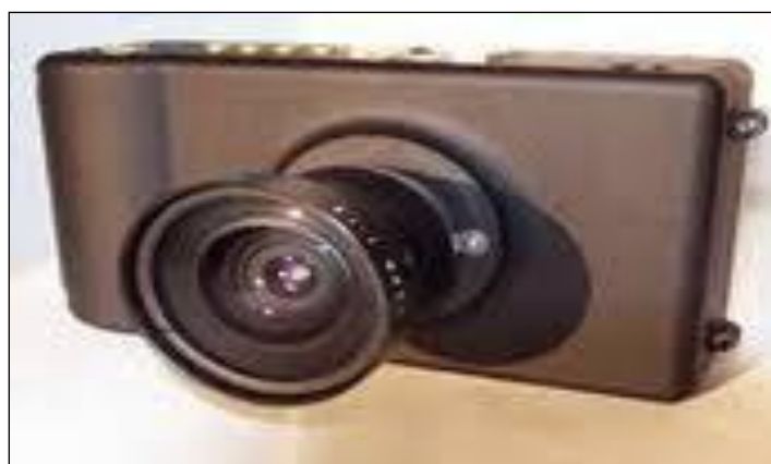
Fig. 2. Tetracam multispectral camera

The acquired 50 pictures were then processed by using two softwares namely TETRACAM Pixel Wrench 2 (TPW2) and MATLAB. The Tetracam Multispectral camera (Fig. 2) captures the images in RAW format. By using Pixel wrench (TPW2) the RAW images were processed and store in BMP format. The BMP images with RGB color index was processed and transformed into BMP HSV color index by using MATLAB.