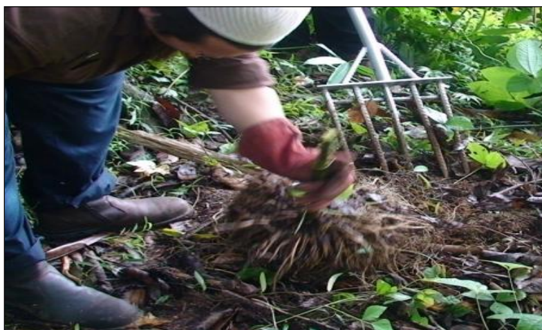
Fig. 1. Collecting the rhizome of D.hispida

The method used is a non-destructive practice which is possible to be use for determination of alkaloid level for this project. Advantages of using non-destructive method for sensing are that it can be fairly accurate, and yields consistent results thereby reducing costs and making agricultural operations and processing safer for farmers and processing-line workers (Tang et al. 2009). It holds great potential and benefits for the agricultural industry because of its simplicity, rapid inspection rate, and broad range of applications.